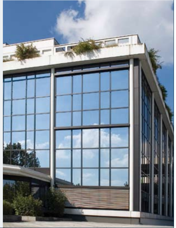
Pegasus Business Center, Munich